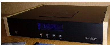
The Tentlabs CD drive, supplied by AudioSense, is a 'toploader', with side panels matching the colour of the loudspeaker cabinets