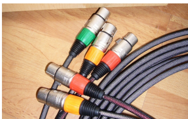
Cables and interconnects are AudioSense-made and tailored to the required length..