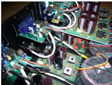
The power amps are class-D, so quite compact. They are supplied by AudioSense in various configurations.

the DEQX, they also look after its programming, setting up and adjustment during home delivery. They can supply a complete set of necessary components, such as Hawk D-701 power amplifiers (six housed in 4 cabinets). The set tested by me comprised the following: DEQX 2.6P, AudioSense-assembled interconnects between the balanced processor outputs and the balanced power amplifier inputs, digital power amplifiers, cables to connect the power amps with the 3-way